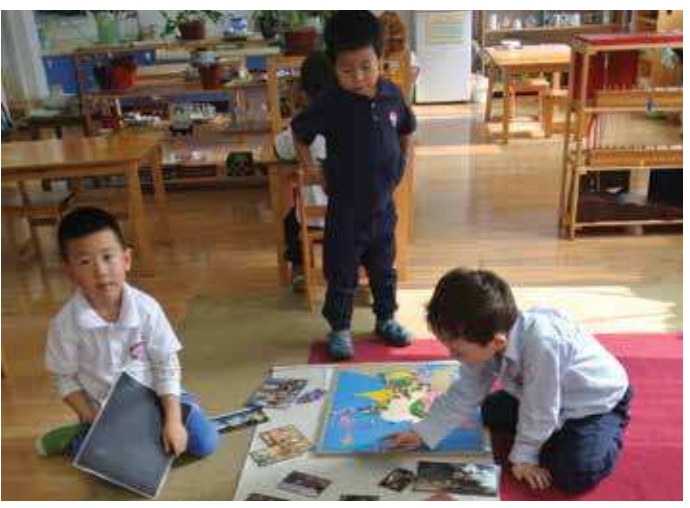
Alphabet. These open-ended materials were a platform for many conversations about the world and its people.

The Montessori materials are rich in hands-on, concrete exploration of reality, and "offer the world to the child" in a way they can tangibly explore. An example is the Sandpaper Globe, which young children in the sensitive period for touch can feel the continents and the oceans, learning land and water. The Puzzle Maps of the continents are endlessly interesting and children learn the names and locations of the countries. Many children carefully illustrated large maps of their own to take home. The Geography folders extend their experience by offering children collections of photographs of people, places, homes, animals, clothing, types of transportation, and different activities in different places around the world. Children loved to pore over the pictures, noticing details, mixing and sorting them according to various criteria, finding similarities and differences. Some of the older children chose to write their observations using the Movable